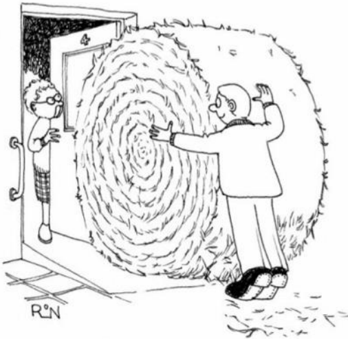
The harvest produce was taken to the old people's bungalows